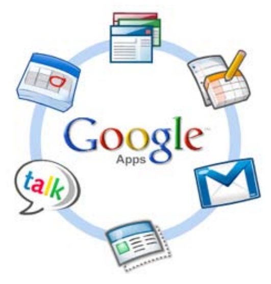
Fig. 3. Google Apps

Currently, the only supported programming language is Python. A limited version of the Django web framework is available, as well as a custom Google-written web app framework similar to JSP or ASP.NET. Google has said that it plans to support more languages in the future, and that the Google App Engine has been written to be language independent. Any Python framework that supports the WSGI using the CGI adapter can be used to create an application; the framework can be uploaded with the developed application. Third-party libraries written in pure Python may also be uploaded.