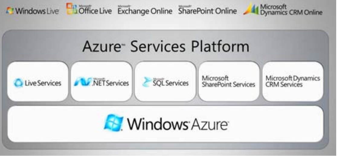
Fig. 2. Windows Azure Services

The Azure Services Platform can currently run .NET Framework applications written in C#, while supporting the ASP.NET application framework and associated deployment methods to deploy the applications onto the cloud platform. Two SDKs have been made available for interoperability with the Azure Services Platform: The Java SDK for .NET Services and the Ruby SDK for .NET Services. These enable Java and Ruby developers to integrate with .NET Services.